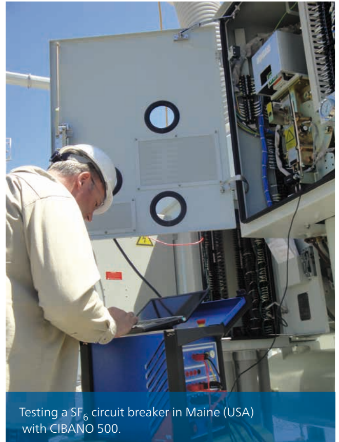
Testing a SF 6 circuit breaker in Maine (USA) with CIBANO 500.